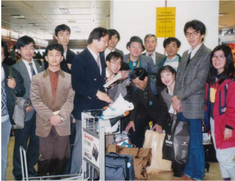
Figure 3: Machi-Ken members on a study trip to Taiwan.